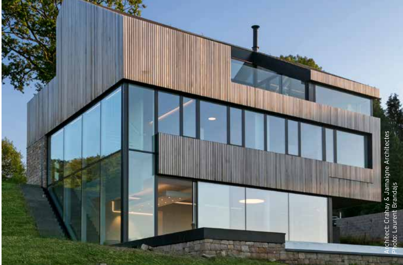
Architect: Crahay & Jamaigne Architectes